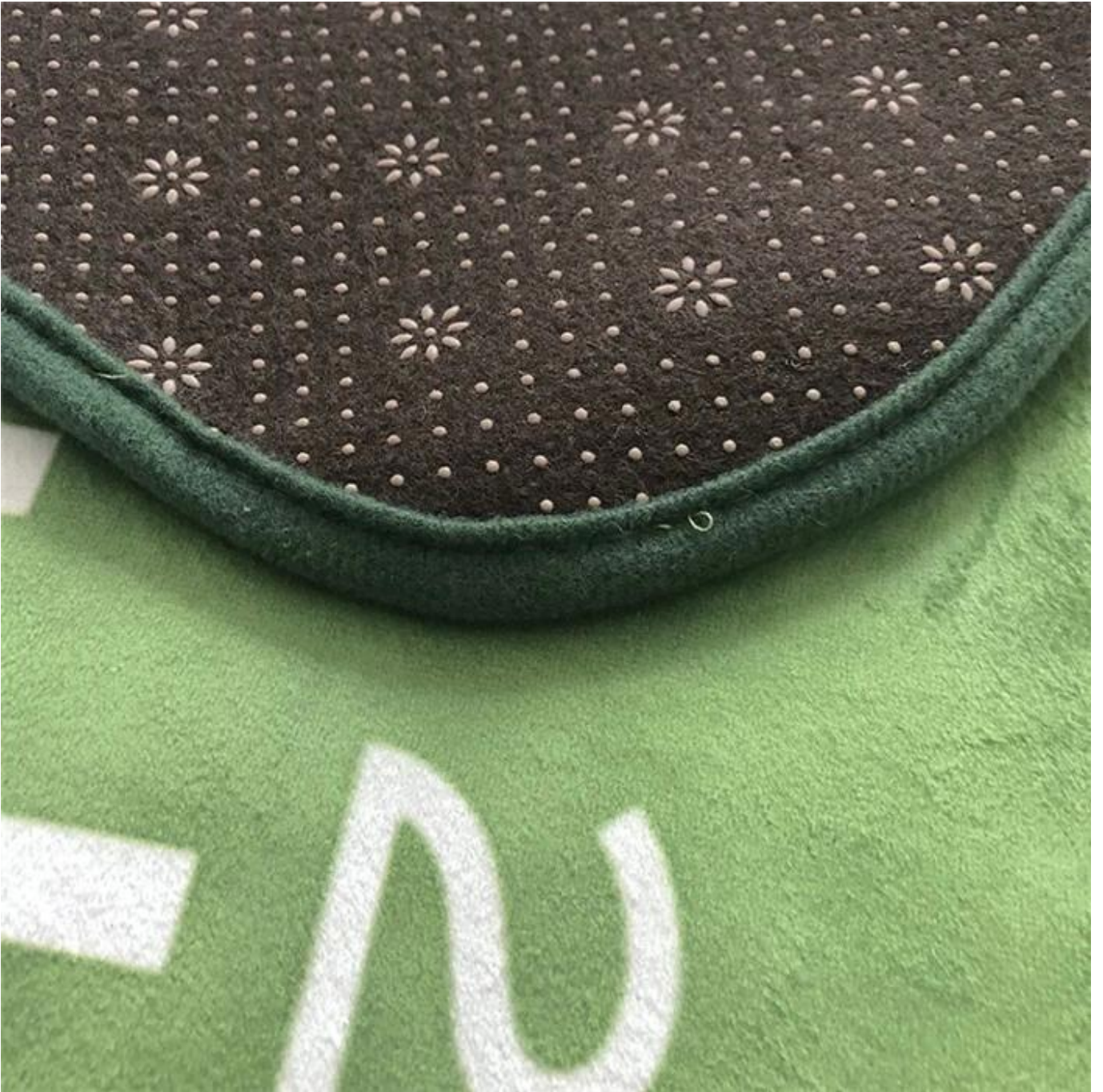
Individual Bag Packing: Easy to be carried.