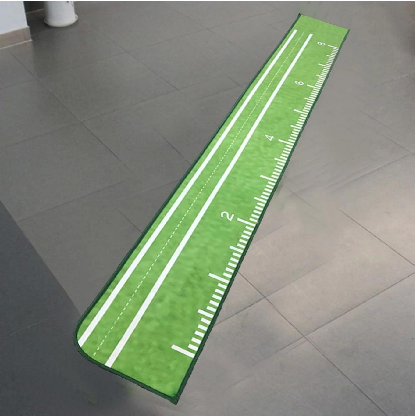
Soft Smooth Polyester Pile: improve putting experience