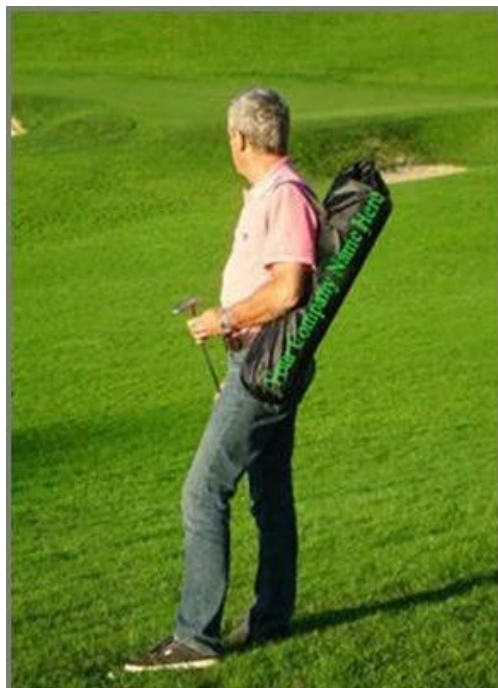
Easy to carry, easy to use !