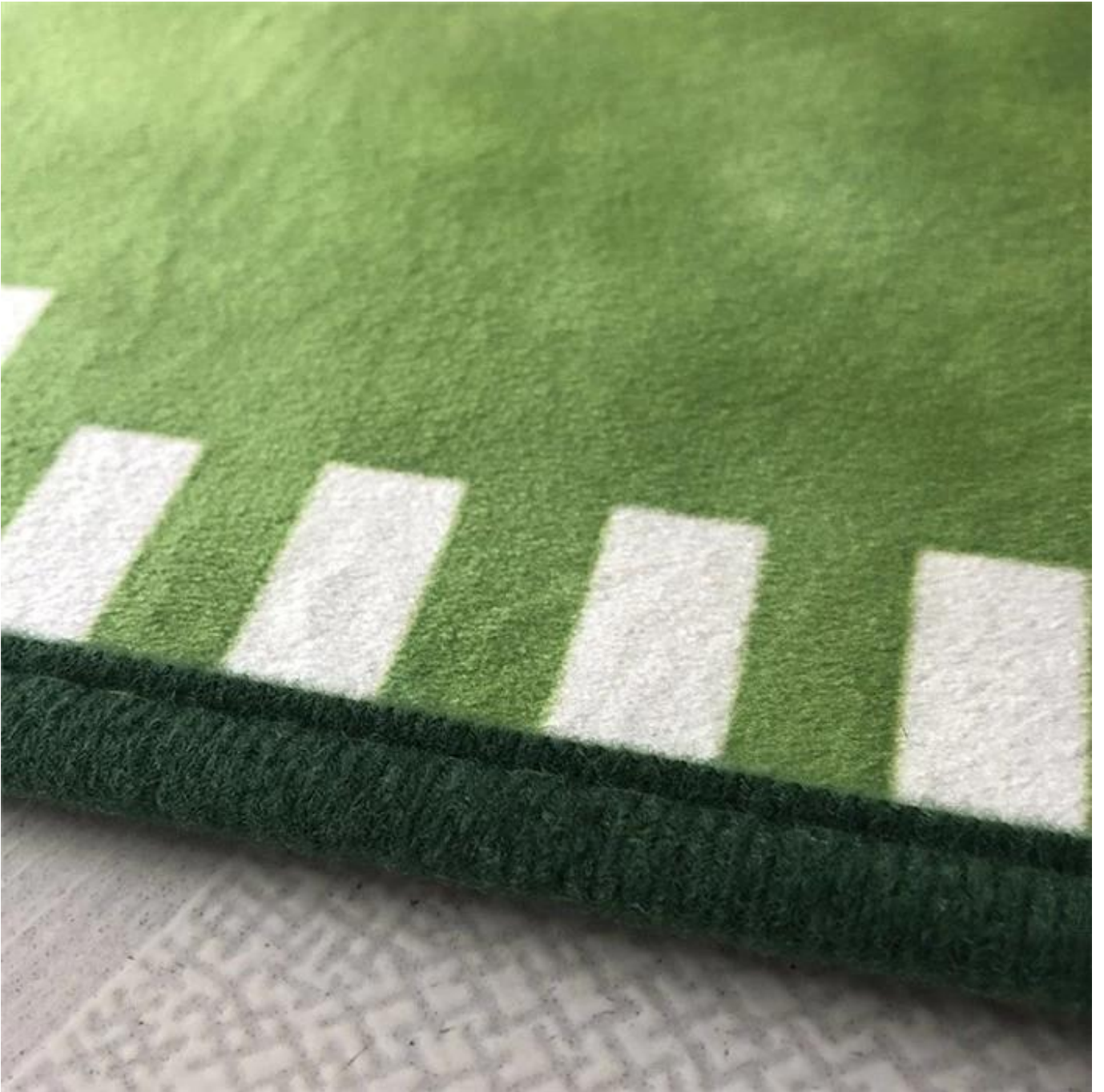
Antiship Design Felt Backing keeps the mat strict to the ground