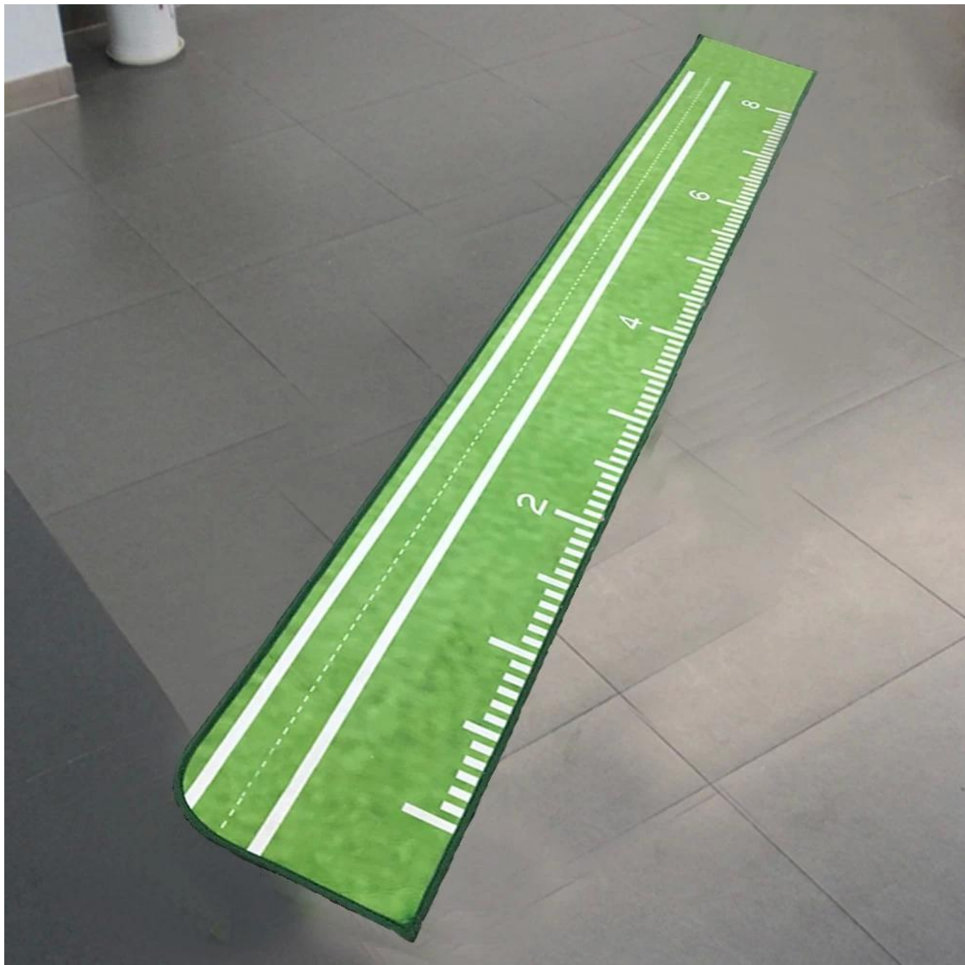
Soft Smooth Polyester Pile: improve putting experience