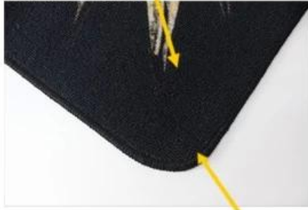
Nylon Loop pile can absorb water effectively

Dyes are permanently injected deep into the nylon pile so that they will not "rub off"