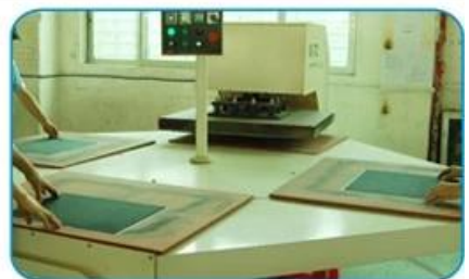
四工位热转印机 Heat transfer Printing Machine