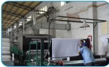
橡胶发泡生产线 Natural Rubber Foam Production Line