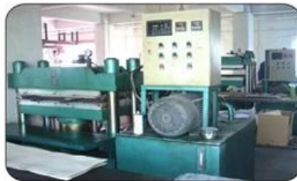
平板硫化机 Bar Runner machine