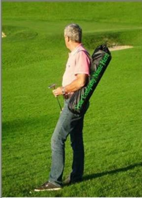
Easy to carry, easy to use !