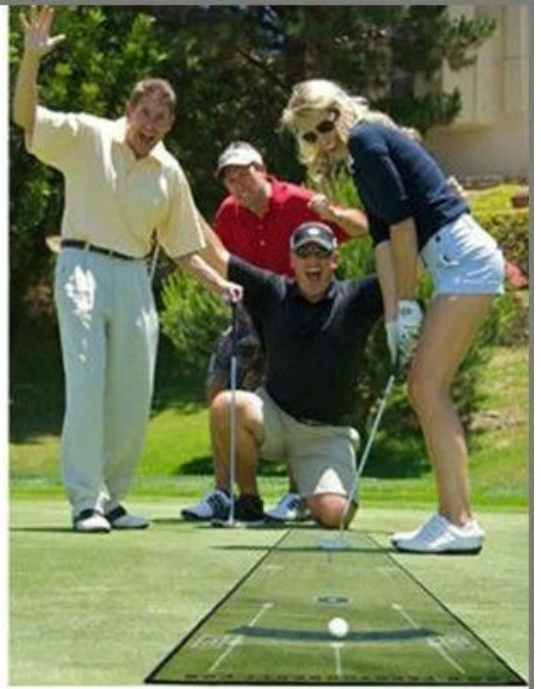
Whenever, wherever !