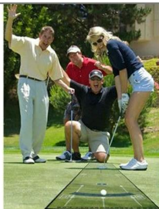
Easy to carry, easy to use !