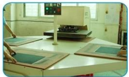
四工位热转印机 Heat transfer Printing Machine