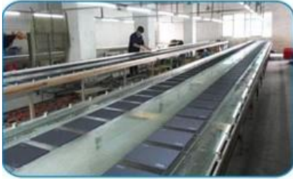
Silk Screen printing 丝印