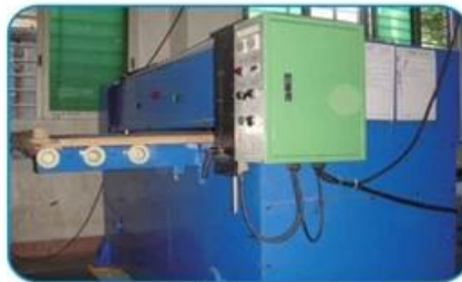
裁断机 Cutting Machine