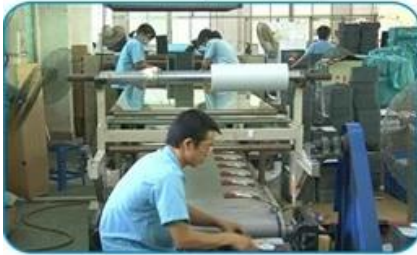
滚筒热转印机 Rolling Sublimation Printing Machine