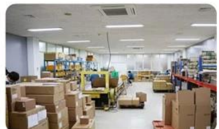
包装车间 Packing Room