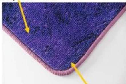
Nylon Loop pile can absorb water effectively

Dyes are permanently injected deep into the nylon pile so that they will not "rub off"