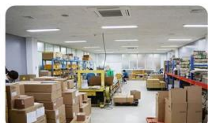
包装车间 Packing Room