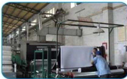
橡胶发泡生产线 Natural Rubber Foam Production Line