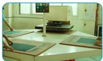
四工位热转印机 Heat transfer Printing Machine