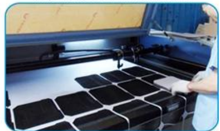
激光切割机 Laser cutting Machine