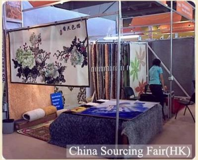
China Sourcing Fair(HK)