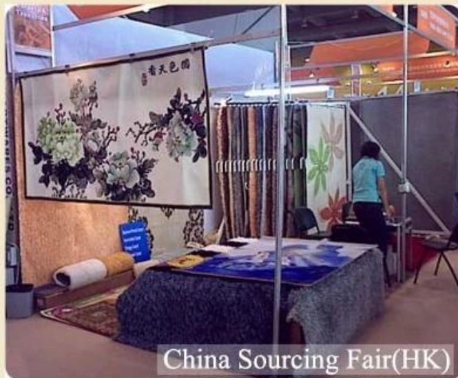
China Sourcing Fair(HK)