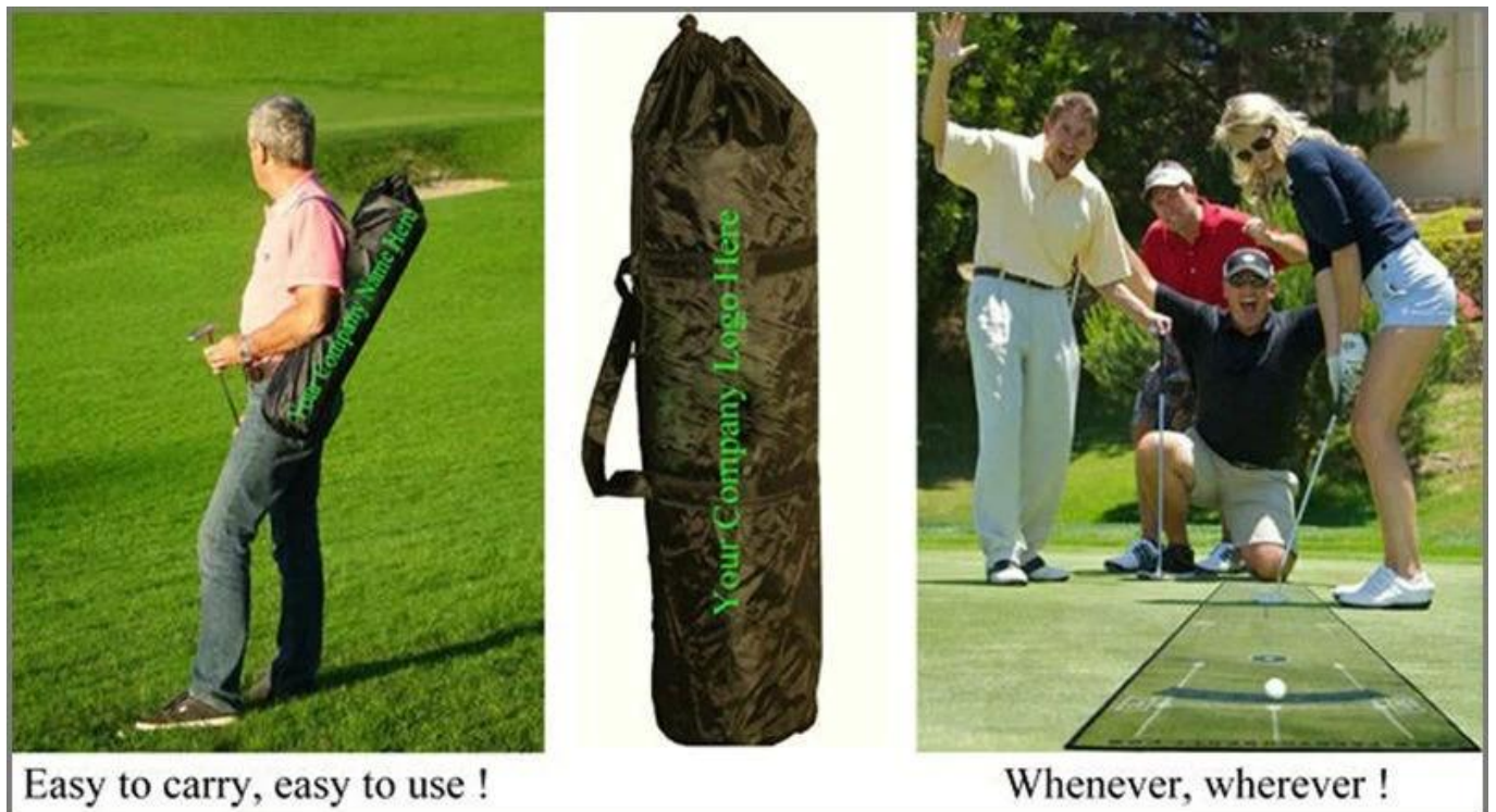
Easy to carry, easy to use !