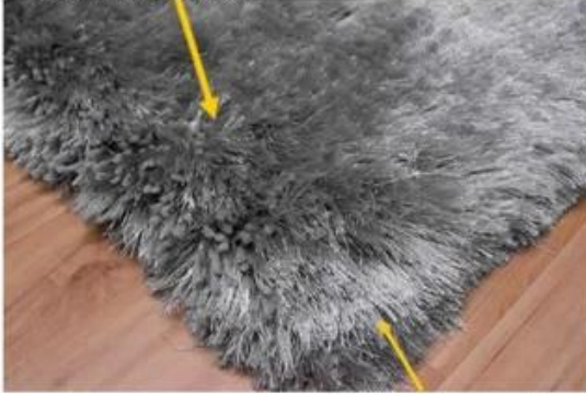
Super water absorption

Polyester Shaggy Surface, soft touching for its high thickness