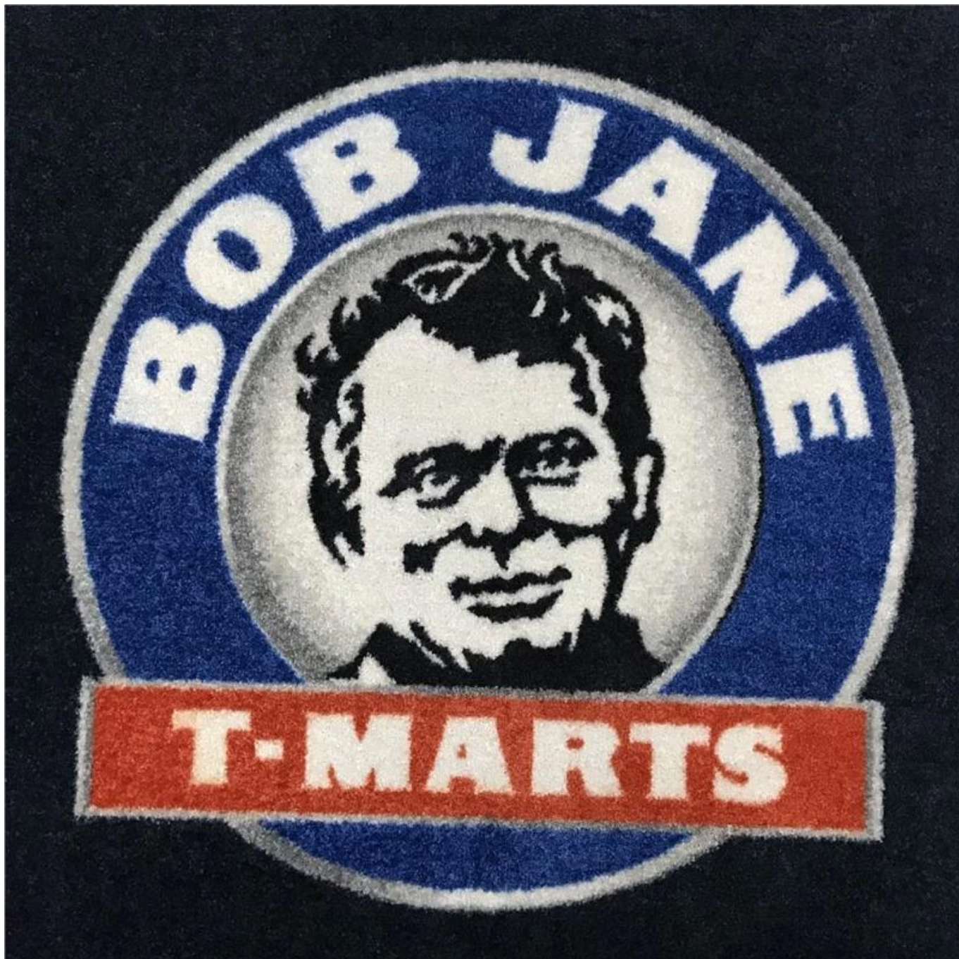
Reference Picture for 4mm Nylon Pile