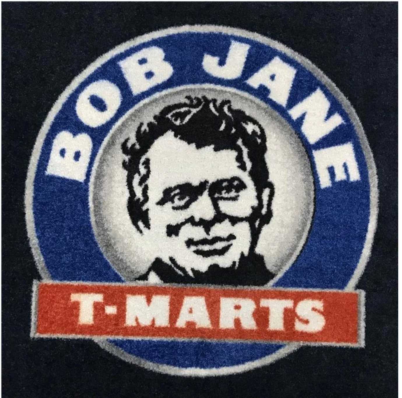
Reference Picture for 4mm Nylon Pile