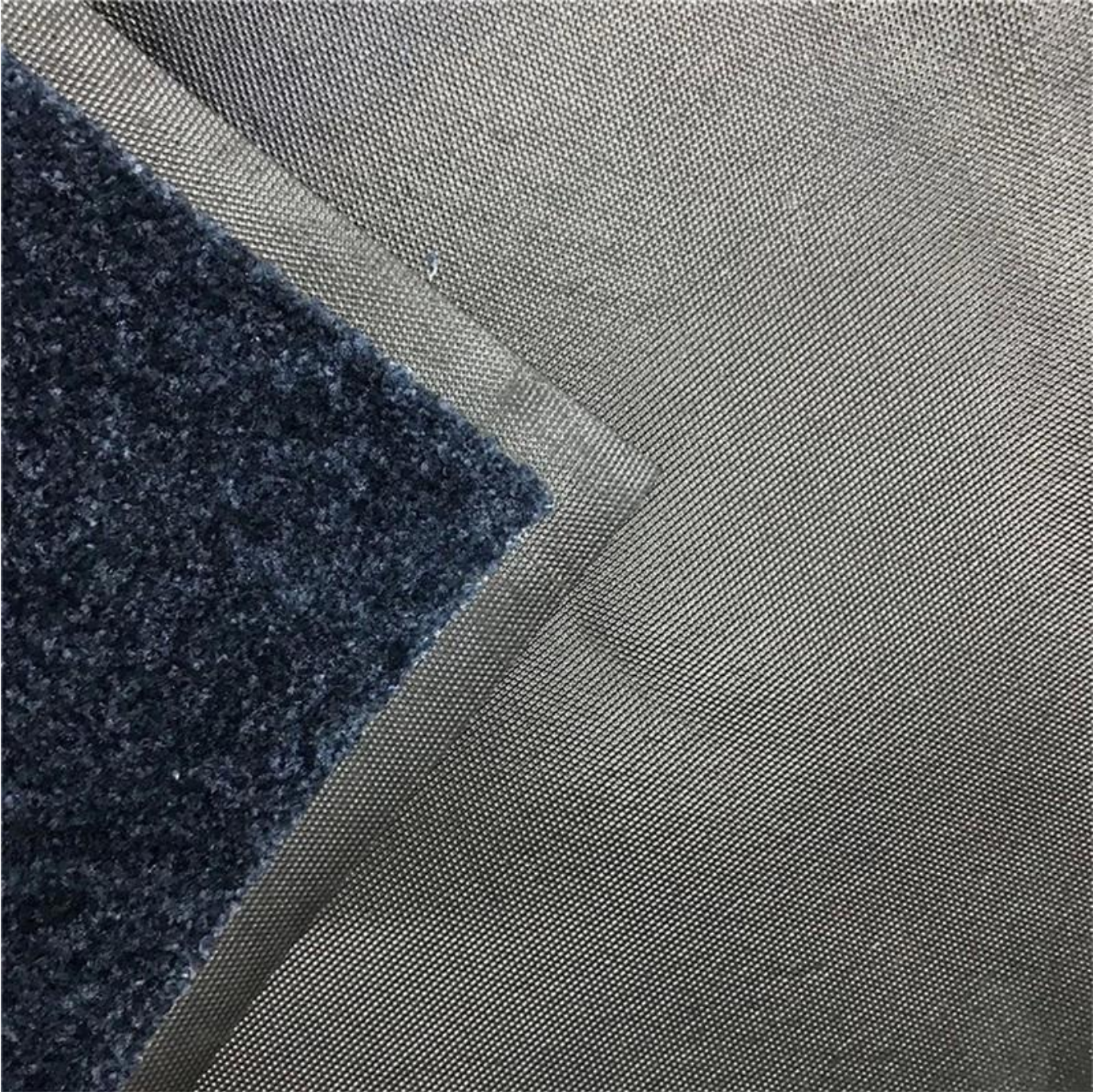
Other Pile Options for Choice: