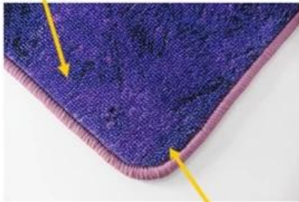
Nylon Loop pile can absorb water effectively

Dyes are permanently injected deep into the nylon pile so that they will not "rub off"