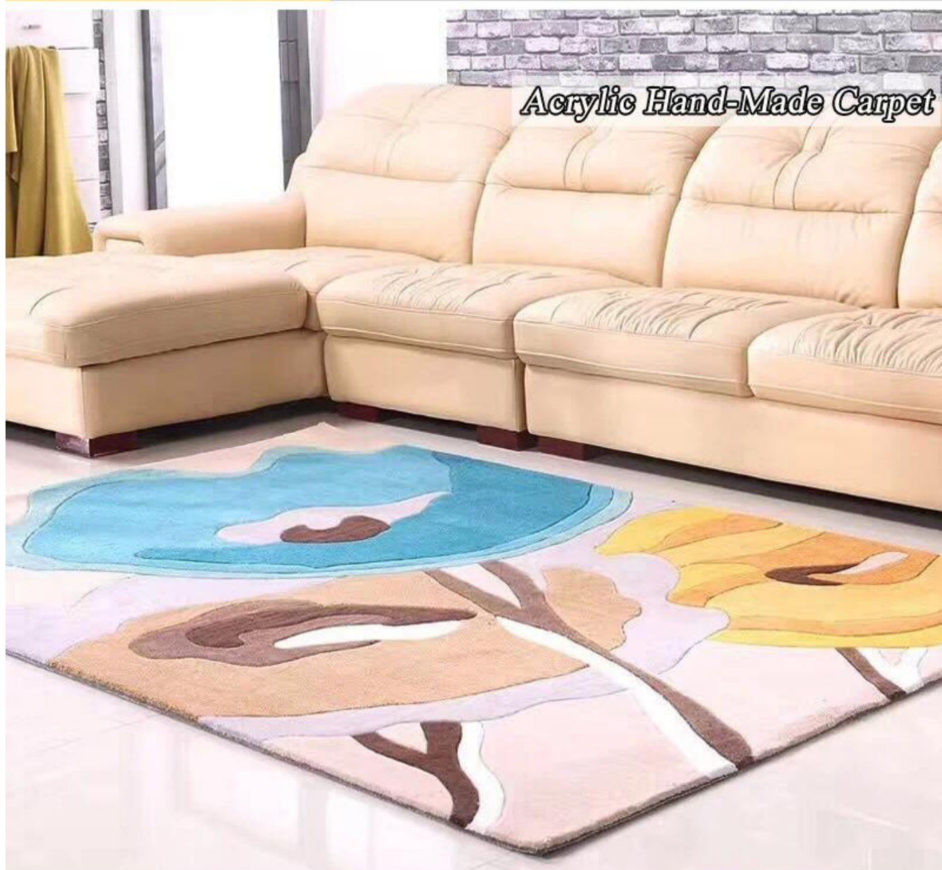
Acrylic Hand-Made Carpet