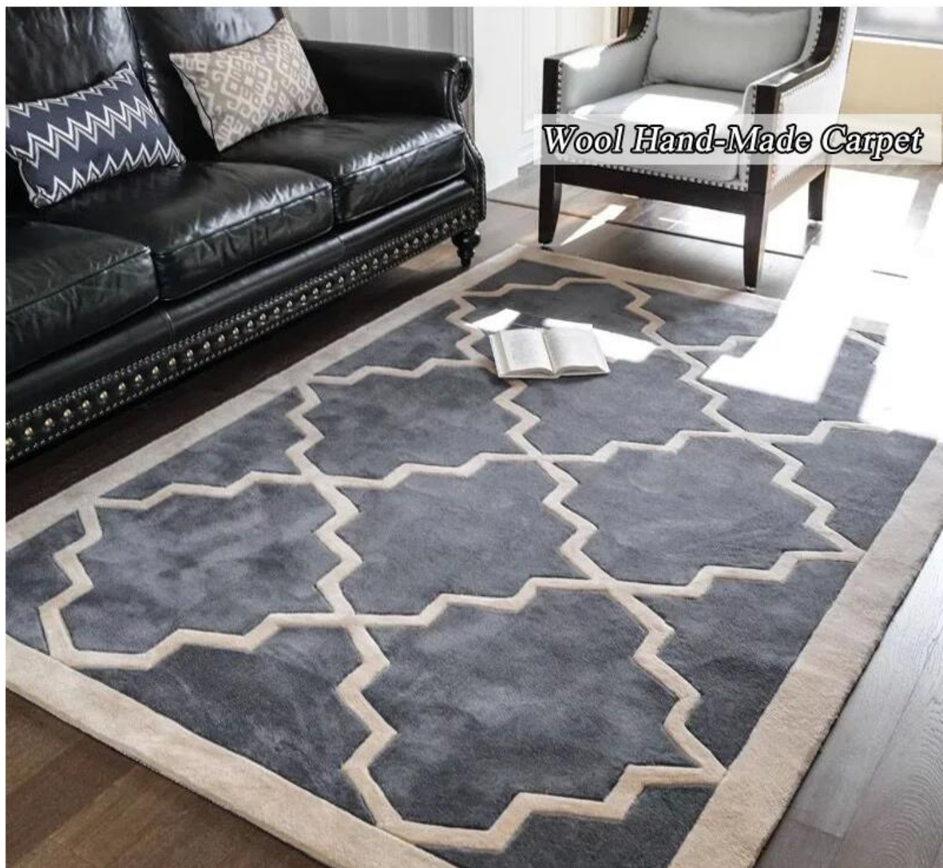
Wool Hand-Made Carpet