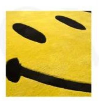
Very thick, made by hand!