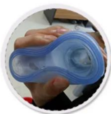
2、 Try to open the mat when it comes soft