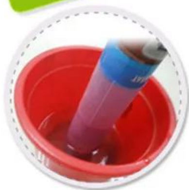
1、 Open the packing then put the mat in warm water

During winter, Sometimes the rolled mat may hard to be opened because of the cold weather. Just follow below guiding to open your mats: