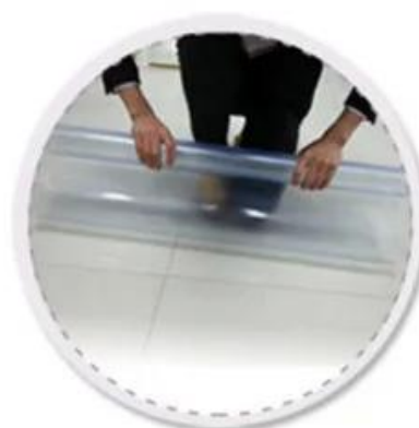
3、 Stand your feet on one side of the mat and use your hand to open the other side