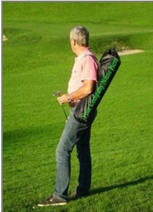
Easy to carry, easy to use !

Individual Bag Packing: Easy to be carried.