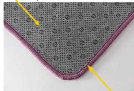
Overlocking can prevent surface peeling off.

Non-woven with dots makes mats more anti-slip