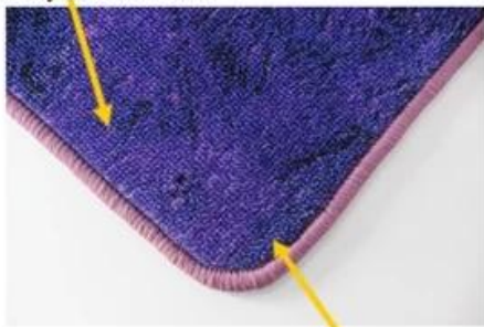
Nylon Loop pile can absorb water effectively

Dyes are permanently injected deep into the nylon pile so that they will not "rub off"