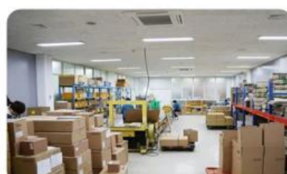
包装车间 Packing Room