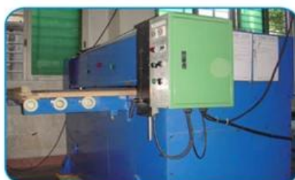
裁断机 Cutting Machine