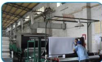
橡胶发泡生产线 Natural Rubber Foam Production Line