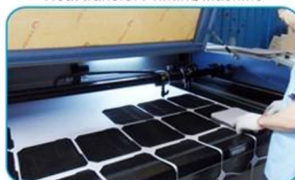
激光切割机 Laser cutting Machine