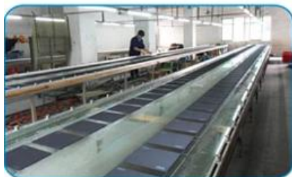
Silk Screen printing 丝印