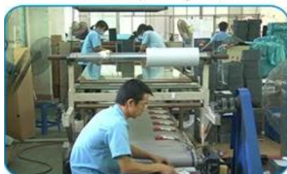
滚筒热转印机 Rolling Sublimation Printing Machine