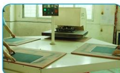
四工位热转印机 Heat transfer Printing Machine