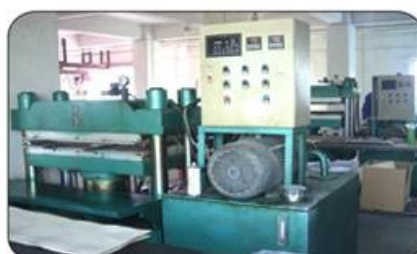
平板硫化机 Bar Runner machine